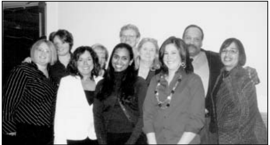
The smiling faces of Murphy Training Stables.