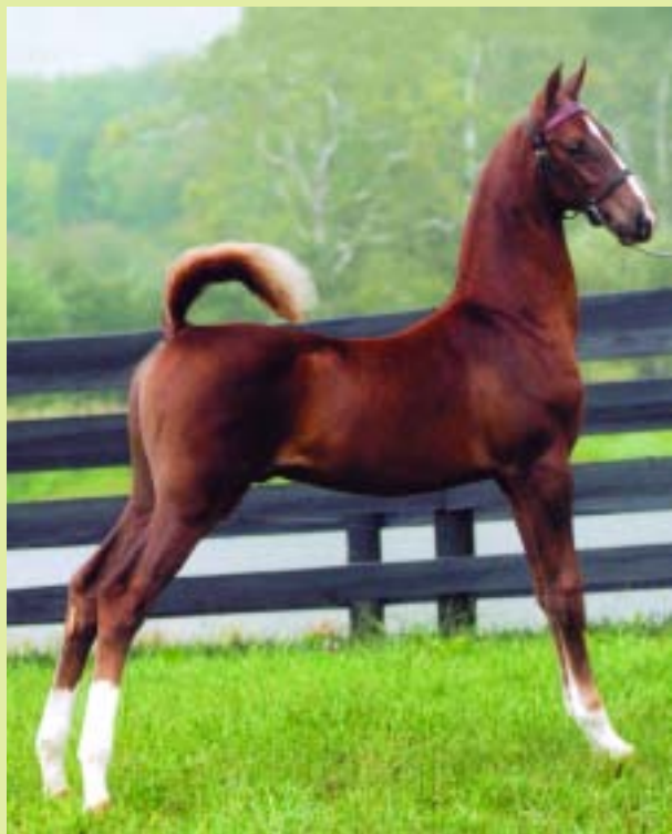
Undulata's Nuts And Bolts.