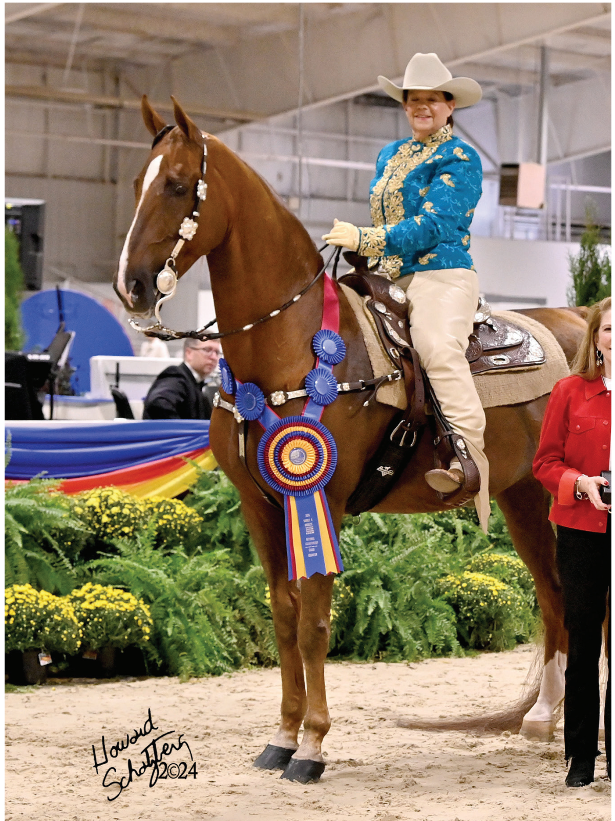
SADDLE & BRIDLE'S 2024 SHATNER WESTERN PLEASURE NATIONAL CHAMPION, CH NUTTA YOU BUSINESS & GEN HESS.

Horses to be judged according to United States Equestrian Federation rules for American Saddlebred Country Western Pleasure horses.